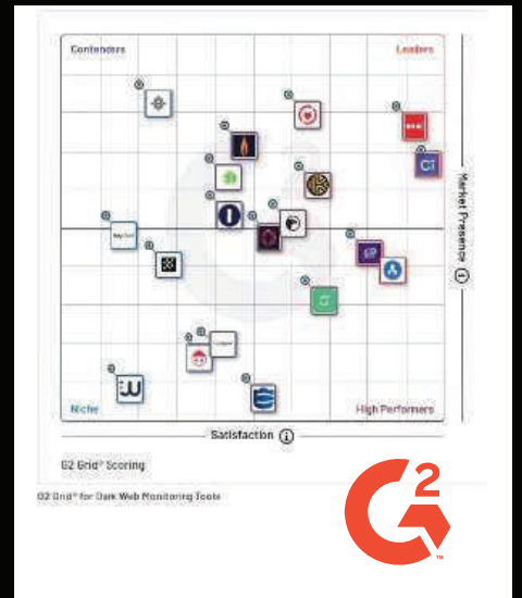
Named a leader in the G2 Grid for Dark Web Monitoring

Cyble Crowned as Leader, High Performer, and Recognized for Easiest Setup and Ease of Use in 13 Categories by G2 Fall 2024 Quadrant